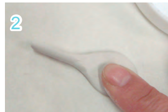
2 Make the clay' s shape like the template and push the top of spoon to be flat.