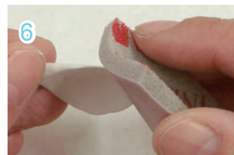
6 After complete drying, smooth the surface by sponge sanding pad.