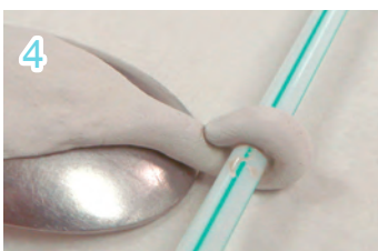
4 Attach the handle of spoon part around the straw to make the hole for string.