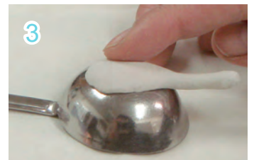
3 Shape the top of spoon to be round using the back of measuring spoon.