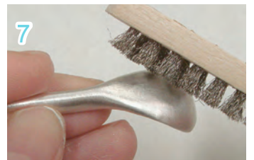
7 After firing, finish with a stainless steel brush.

*Be careful handing dried silver clay, because it is fragile when it's dried.