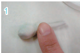
1 Rolling Art Clay silver on the cooking sheet.